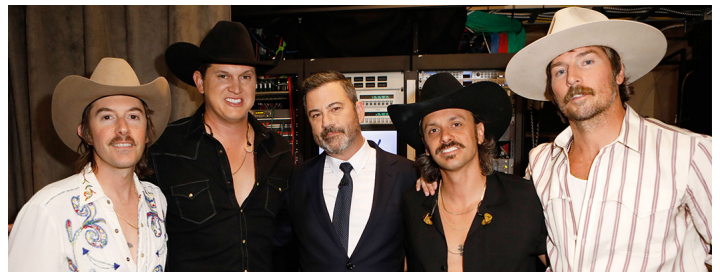
Midland and Jon Pardi performed “Longneck Way To Go,” which is nominated for two Country Music Association Awards, on network TV for the first time during the Oct. 11 broadcast of ABC’s Jimmy Kimmel Live! From left: Midland’s Jess Carson, Pardi, Kimmel and Midland’s Cam Duddy and Mark Wystrach.

Ultimately, it’s those human tales — the ones delivered by singular artists — that built both Music City and the Rotunda that houses the bronze plaques of the Country Music Hall of Fame. Johnny Cash , Jimmie Rodgers and Willie Nelson will have to make room for three more occupants who made their entrance somewhere else but left their mark in Nashville. ●