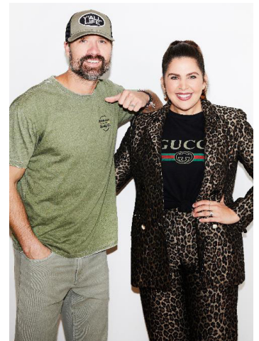
Walker Hayes visited with host Hillary Scott for the Oct. 9 edition of Apple Music's Country Faith Radio .