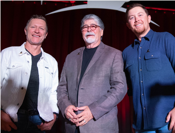
Scotty McCreery (right) received the Randy Owen Angels Among Us Award from St. Jude Children's Research Hospital in Memphis during the Country Cares Seminar on Oct. 8. He's pictured with Craig Morgan (left) and Owen.