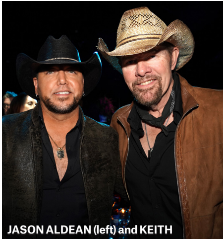
JASON ALDEAN (left) and KEITH