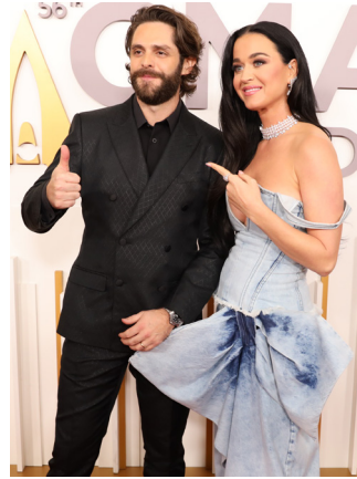
Thomas Rhett and Katy Perry walked the carpet prior to performing “Where We Started” on the show.