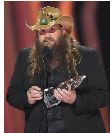
Chris Stapleton accepted his sixth male vocalist trophy in the last eight years.