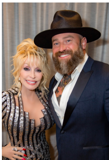
Dolly Parton was inducted into the Rock and Roll Hall of Fame on Nov. 5. Zac Brown's namesake band backed her up during a rendition of "Jolene."