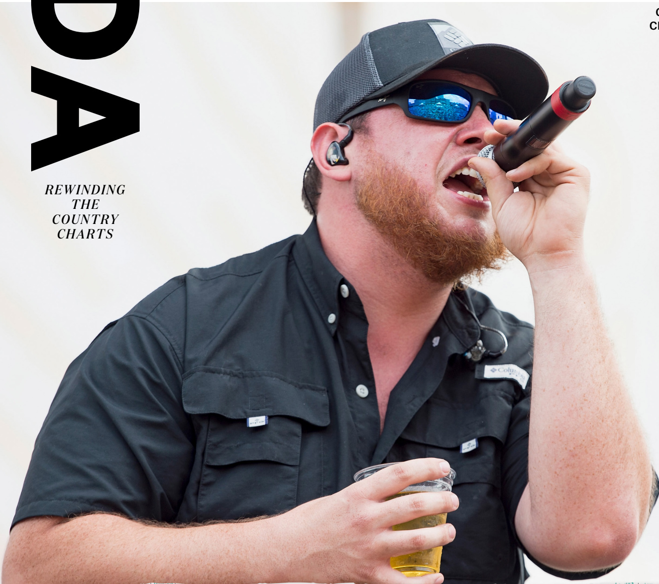
Combs at the 2017 CMA Music Festival in Nashville.