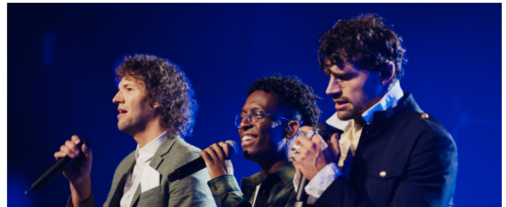
For King & Country's Luke Smallbone (left) and Joel Smallbone (right) performed with BRELAND for an edition of CMT Crossroads that premiered Dec. 12.