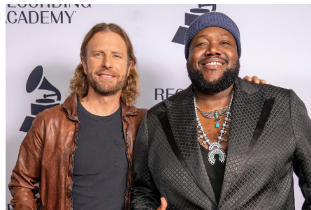
Bentley (left) and The War and Treaty's Trotter were among the attendees of a Jan. 24 Grammy Nominee Celebration at Nashville's Hutton Hotel.

There are exceptions. Combs' revision of "Fast Car," a best country solo performance nominee, is a faithful update of a classic, though the present circumstances are different: Male singer Combs renders it from a different perspective than female originator Tracy Chapman , and it reemerged in country instead of