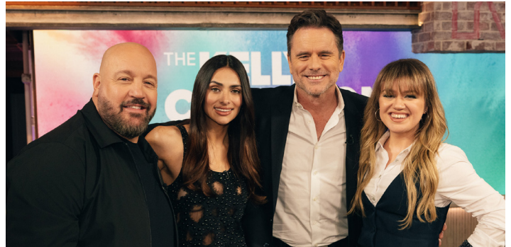
Charles Esten played music from his debut album, Love Ain't Pretty , during a Jan. 29 appearance on NBC's The Kelly Clarkson Show . From left: fellow guests Kevin James and Renata Notni, Esten and Clarkson.

At the Grammys, that past dictates how country moves into its future. ●