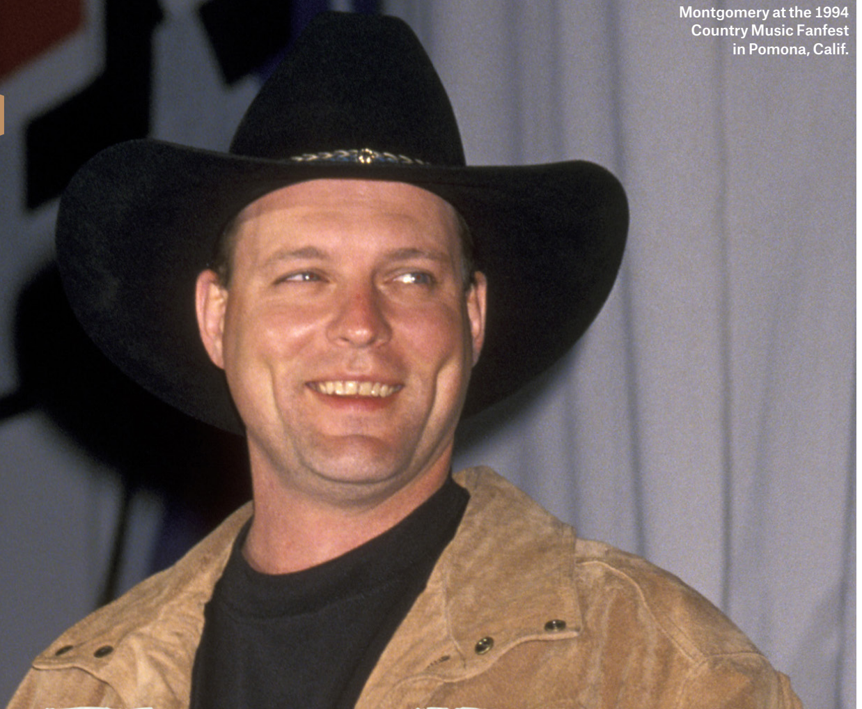
Montgomery at the 1994 Country Music Fanfest in Pomona, Calif.

John Michael Montgomery boasts 20 Hot Country Songs top 10s, from "Life's a Dance" in 1993 through "Letters From Home" in 2004. Now 59, he is one of many venerable country hitmakers who have recently announced retirement tours . —JIM ASKER