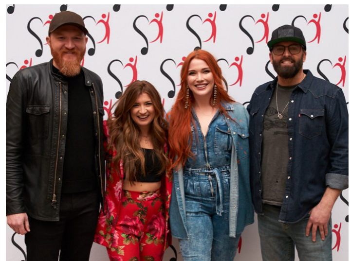
Tenille Townes raised $418,000 for charity with her 13th annual Big Hearts for Big Kids benefit in Grande Prairie, Canada. From left: performers Eric Paslay, Townes, Caylee Hammack and Dean Brody.