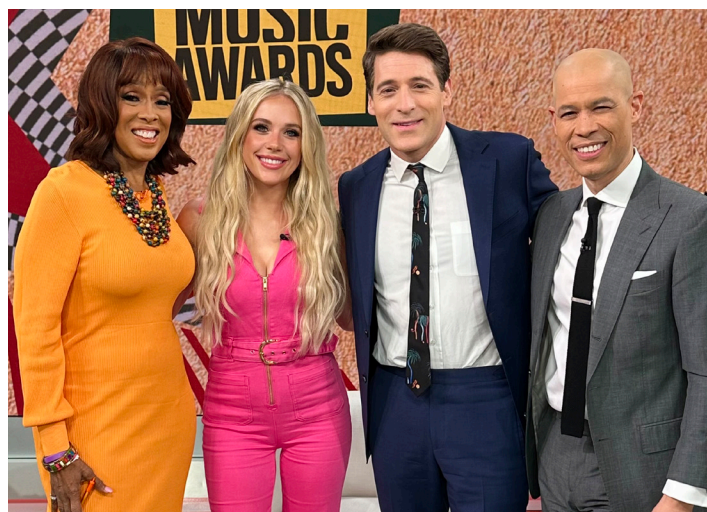
Megan Moroney made her first appearance on CBS Mornings on April 1 ahead of the network's April 7 telecast of the CMT Music Awards. From left: co-host Gayle King, Moroney, co-host Tony Dokoupil and featured host Vladimir Duthiers.