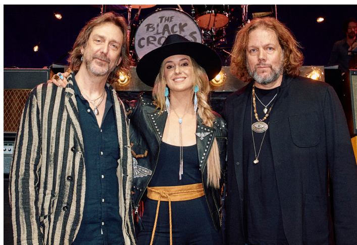
Lainey Wilson made a surprise appearance during The Black Crowes' Happiness Bastards tour launch on April 2 at Nashville's Grand Ole Opry House to perform two songs including "She Talks to Angels." Wilson is flanked by band members Chris Robinson (left) and Rich Robinson.