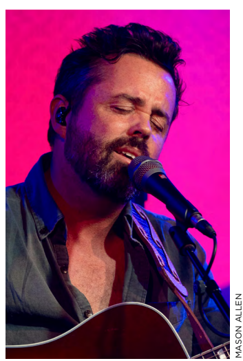
Brad Tursi performed July 17 at the Blue Room in Nashville to promote the July 19 release of his solo album Parallel Love .