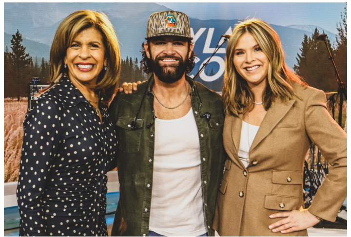
Dylan Scott performed "I Owe You One" during an Oct. 21 appearance on NBC's TODAY . With him are co-hosts Hoda Kotb (left) and Jenna Bush Hager.

"I think that we make patterns," Ballerini said, "so they don't make us." ●