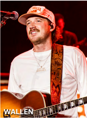
FOR MORGAN WALLEN'S ONE NIGHT AT A TIME 2024

A GOOD TOP 10 ‘HABIT’ Tim McGraw claims his own slice of Country Airplay history by scoring his record-tying 61st top 10 as “One Bad Habit” (McGraw/Big Machine) bounds 11-5 (24 million, up 40%). McGraw matches Kenny Chesney and George Strait for the most top 10s. Alan Jackson is next, with 51; followed by Keith Urban (44); Toby Keith (42); and Brooks & Dunn (41). Plus, with “One Bad Habit” climbing to No. 5, McGraw pads his lead for the most top five hits on the chart: 55. Strait is second, with 53; Chesney has 50. ●