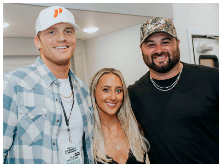
Koe Wetzel (right) headlined when Billboard presented a show at The Stage in Austin during South by Southwest on March 13. With him backstage are Parker McCollum and Ashley Cooke.