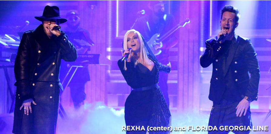
REXHA (center) and FLORIDA GEORGIA LINE