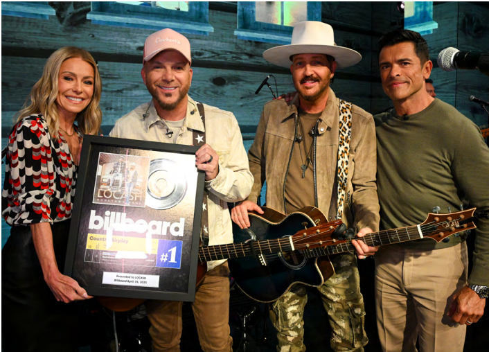
LOCASH received a plaque recognizing its No. 1 single on Billboard ’s Country Airplay chart with “Hometown Home” when the duo appeared May 19 on the syndicated daytime TV show Live With Kelly & Mark . From left: co-host Kelly Ripa, LOCASH members Chris Lucas and Preston Brust, and co-host Mark Consuelos.