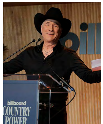
Clint Black (above) presented the hitmaker award to Riley Green.