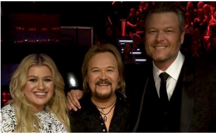
Travis Tritt (center) was one of the guest performers for the May 21 finale of NBC's The Voice . He's flanked by coaches Kelly Clarkson and Blake Shelton.