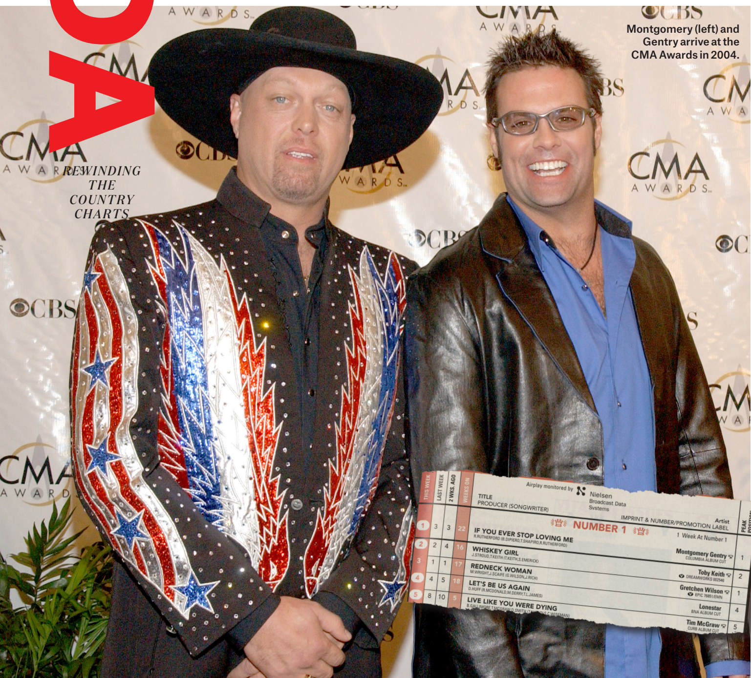
Montgomery (left) and Gentry arrive at the CMA Awards in 2004.