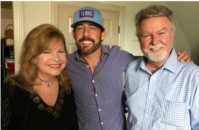
Aaron Watson (center) appeared on Crook & Chase in conjunction with the June 21 release of his album Red Bandana . He's flanked by co-hosts Lorianne Crook and Charlie Chase.