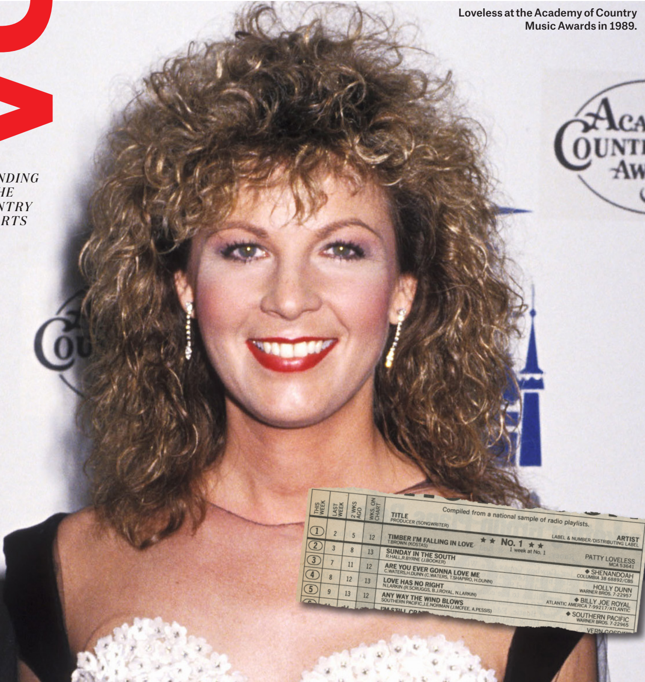
Loveless at the Academy of Country Music Awards in 1989.

A distant cousin to country legend Loretta Lynn , Loveless was born in Elkhorn City, Ky., on Jan. 4, 1957. Known for her powerful and pure vocal style, she joined the Grand Ole Opry in 1988. Between 1985 and 2004, Loveless logged 44 appearances on Hot Country Songs, including five No. 1s among 20 top 10s. Married to record producer Emory Gordy since 1989, the 62-year-old Loveless lives in the Georgia countryside on 170 acres. She still performs occasionally and appeared in June at Romp Fest in Owensboro, Ky., a roots-music festival presented by the Bluegrass Hall of Fame. —JIM ASKER