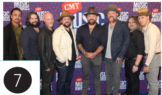
ZAC BROWN BAND Leaving Love Behind

Americana/Folk Albums ranks the most popular Americana/folk albums of the week, as compiled by Nielsen Music, based on multi-metric consumption (blending traditional album sales, track equivalent albums, and streaming equivalent albums). Copyright 2019, Prometheus Global Media, LLC and Nielsen Music, Inc. All rights reserved.