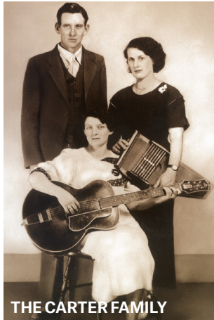
THE CARTER FAMILY

The Carter Family will receive plenty of attention in the forthcoming Ken Burns documentary when Country Music debuts Sept. 15 on PBS. The first recording in episode one is the act's "I'm Thinking Tonight of My Blue Eyes," while the final track in the eighth episode is Mother Maybelle Carter 's version of "Wildwood Flower" with The Nitty Gritty Dirt Band . In between, the series features over 20 Carter Family recordings or performances while showing the trio's influence from its original 1927 sessions in Bristol, Va., through a lineage that has extended several generations. In timely fashion, two more Carter projects are on the way: The Chuck Wagon Gang releases No Depression in Heaven: The Gospel Songs of the Carter Family on Aug. 30, while another album featuring multiple generations of the Carters, including John Carter Cash and Carlene Carter , is expected in October.